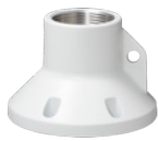
WV-QCL101-W Mount Bracket